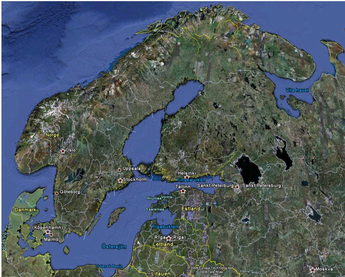
Figur 3. Sveriges närområde